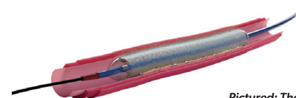
Pictured: The drug-coated balloon being delivered through an artery.

A minimally invasive procedure or surgery minimizes the size of the incision. In the case of the drug-coated balloon procedure, only one needle will puncture the skin once. The advantage is that minimally invasive procedures reduce healing time, pain, risk of infection and scarring.